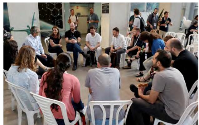
Panel discussion at the Young Academy conference.